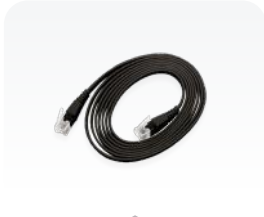
UTP Flat Cable (1.5m)