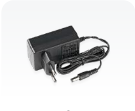
24 V 1.2 A power adapter