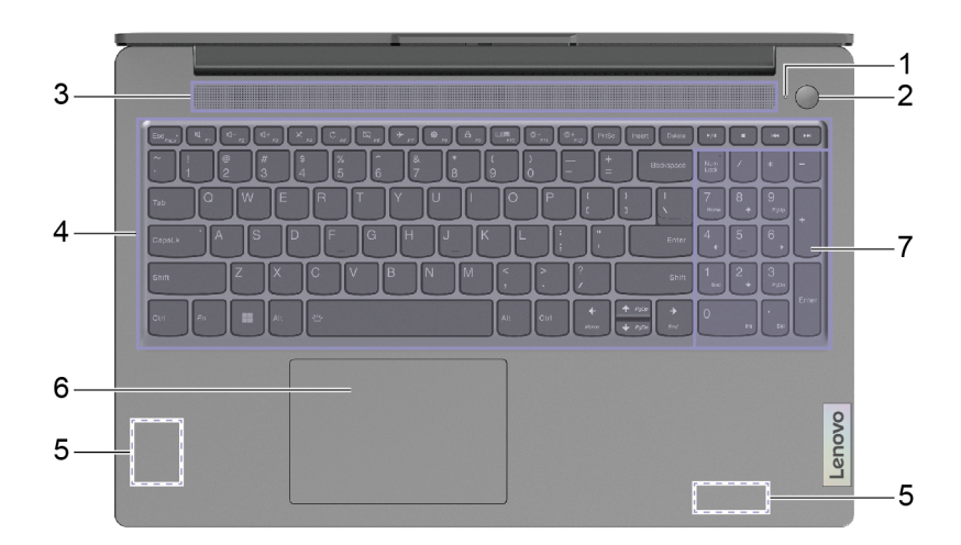
Figure 2. 15-inch models