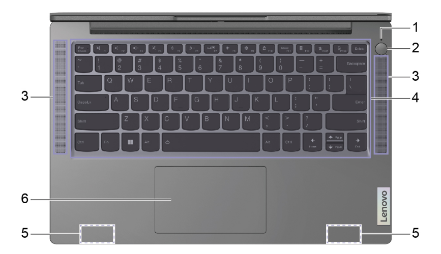
Figure 1. 14-inch models