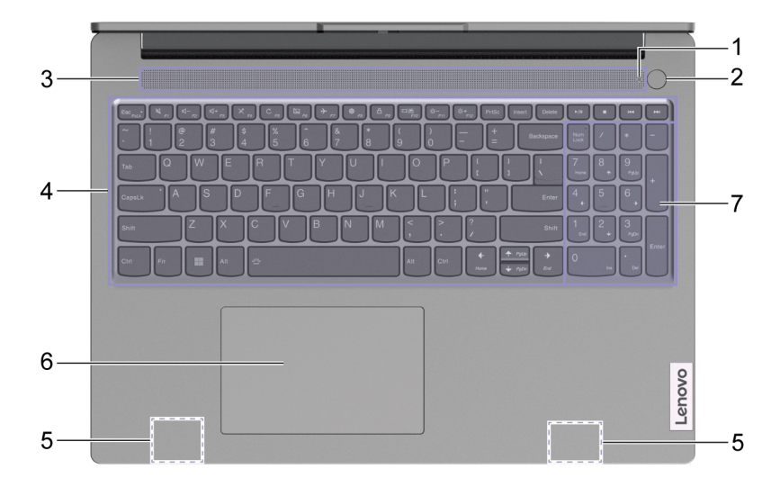
Figure 3. 16-inch models