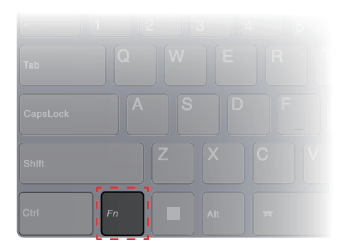
Figure 4. Location of the Fn key

Note: The FnLock switch does not apply to hotkeys not found in the first row of the keyboard. To use these hotkeys, always hold down the Fn key while pressing the key.