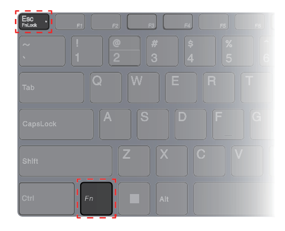
Figure 5. Locations of the FnLock key and the Fn key

A Lenovo keyboard usually contains hotkeys in the top row. These hotkeys share keys with the function keys (F1–F12) and other keys. For these dual-function keys, the icons or characters denoting the primary functions are printed on top of the icons and characters denoting the secondary functions.