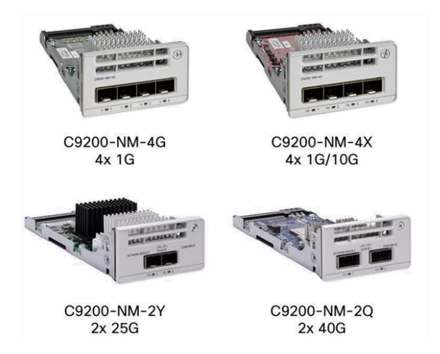
Figure 2. Cisco Catalyst 9200 Series Switch network modules

Cisco Catalyst 9200 Series switches come with modular or fixed uplinks as indicated in Table 1. With modular SKUs, the field-replaceable network modules provide infrastructure investment protection by allowing a nondisruptive migration from 1G to 10G and beyond. When you purchase the switch, you can choose from the network modules described in Table 3.