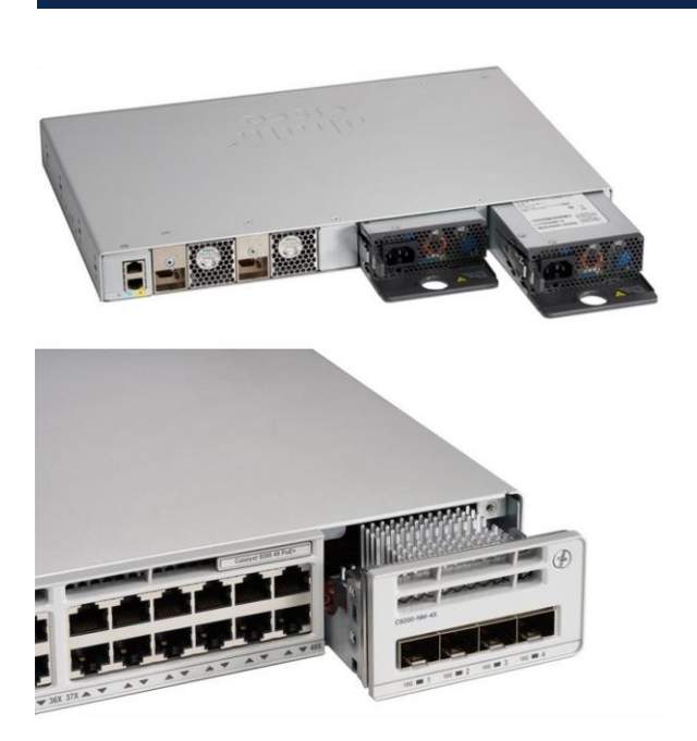
Figure 3. Cisco Catalyst 9200 Series Switch dual redundant power supplies

Table 4 lists the PoE power availability for each model.