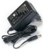
24V 0.8A power adapter