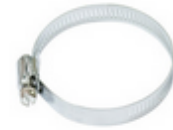
Metal ring (one)

*DIN mount includes four screws to attach it to the back of the device.