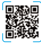
Govee Home App

For FAQs and more information, please visit: www.govee.com