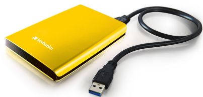
Внешние жесткие диски