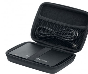
Чехлы для жестких дисков