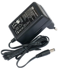
24 V 1.2 A power adapter